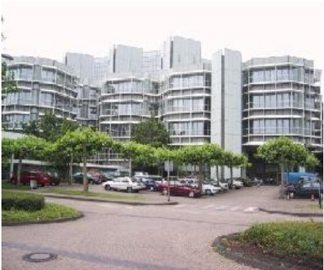
Rhein Energy Kohln