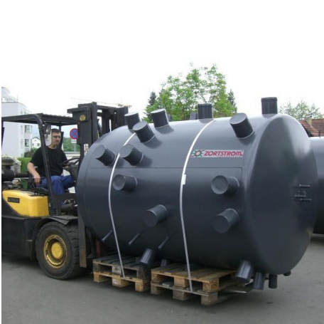
Centre load on trailer