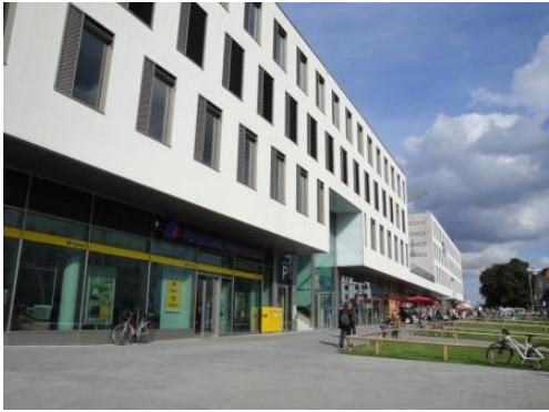
Railway Station Pasing Munich 960kW