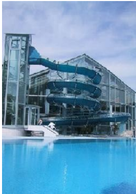
Freibad Bad Neustadt a.d.Saale