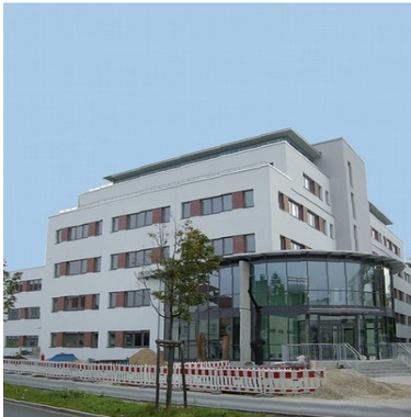
Siemens Forum Puls 4 stage Centre