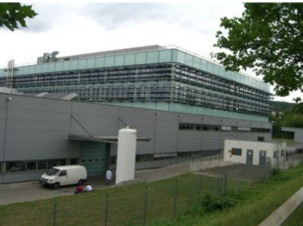
Pfeifer Vacuum Asslar